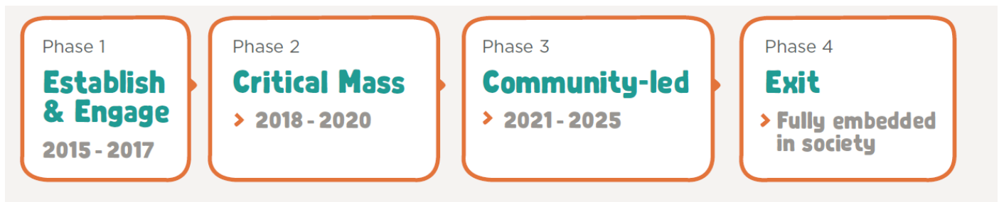
Diagram 1: Financial Inclusion Action Plan Program Phases, From Foundations to Actions FIAP Program Report March 2018.

The holistic , system-wide change needed to increase financial inclusion and resilience in Australia will take time and long-term commitment to work collaboratively - the FIAP program is therefore designed to span a 10-year horizon , encompassing four distinct phases as described in Diagram 1 below.